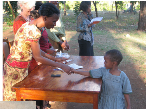
Nursery student receiving a reward

closed until January 10. The students participated in the closing ceremony where students were recognized for cleanliness, discipline, hard work, etc. Also the top 3 students in each class were recognized.