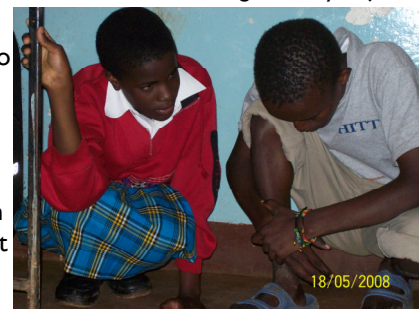
Form 1 student ministering to a boy at jail

encourage and minister to the younger boys at Fountain of Hope. So he was given permission to move to the dormitories of the younger boys from where he was staying, not far from the school, in order to be obedient to what God spoke to him about.