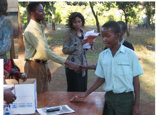
Students receiving a handshake for job well