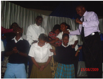
Above: Christ Ambassadors praying over leaders. Below: Grade 7 camp