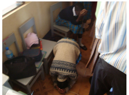
These pictures are from when the Spirit of God feel at the school.