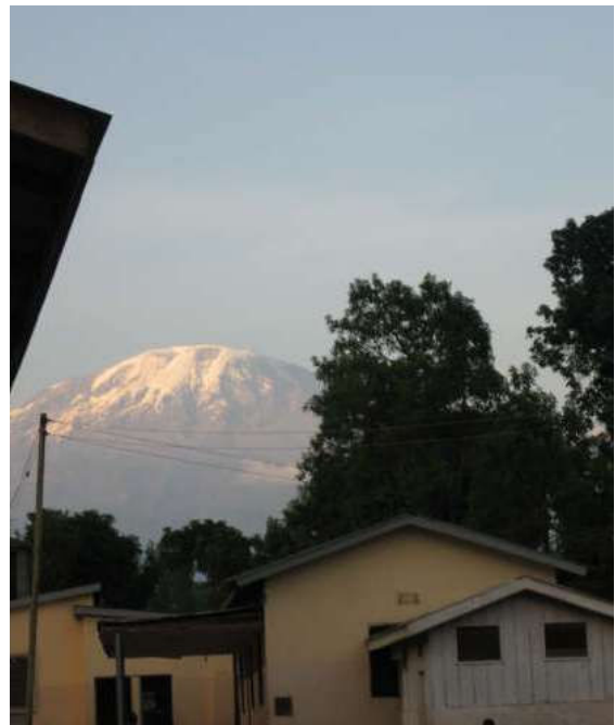
Mt. Kilimanjaro seen from Fountain of Hope